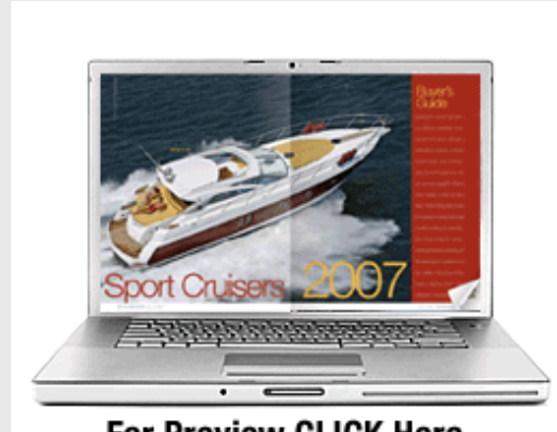
For Preview CLICK Here.