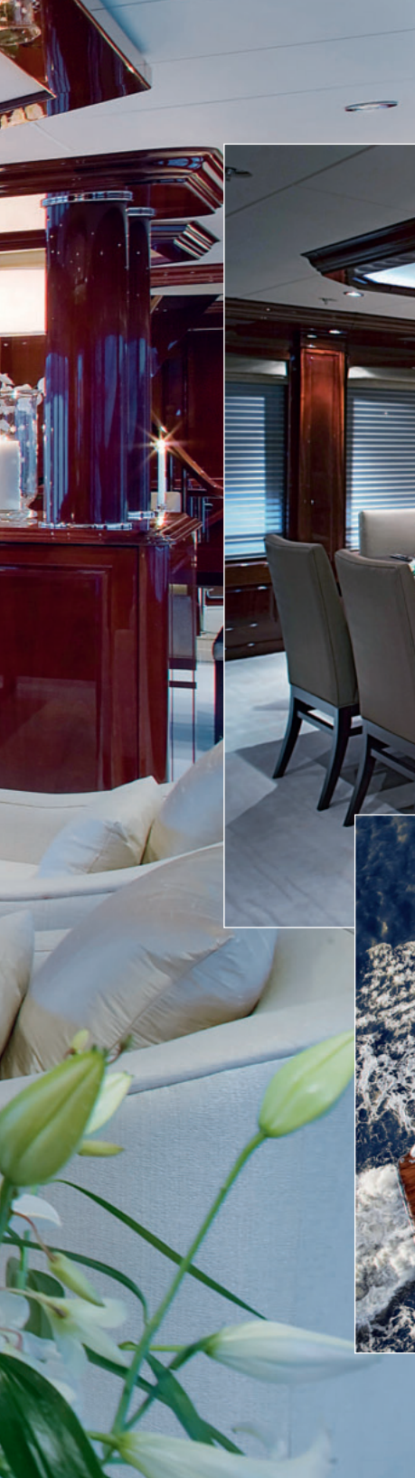
Top and left: Impeccable high-gloss finishes reflect interior features and lighting