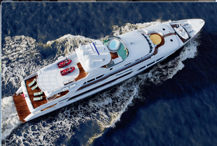
Primadonna's helicopter pad doubles as a storage deck for water toys

er, reveals a system of mounting, support and routing that borders on the obsessive. Bundles of neatly parallel wiring (each strand clearly labeled) and piping (blue for cold water, red for hot) crisscross ceiling bays in logical and geometric fashion to and from switches, breaker panels, manifolds and pumps, all readily accessible and secured with sound- and vibration-isolating hardware as necessary. Even the wooden framework to which finish panels are secured has been sanded and stained to match cabinetry finishes, leaving some to wonder why Christensen even bothers to conceal workmanship of this caliber. It's said that an owner once insisted, as a condition of making his boat available for display at a southeastern yacht show, on replacing a fabric overhead panel with a clear plastic equivalent, the better to show off the functional artwork that lay within. True quality zealots would understand.